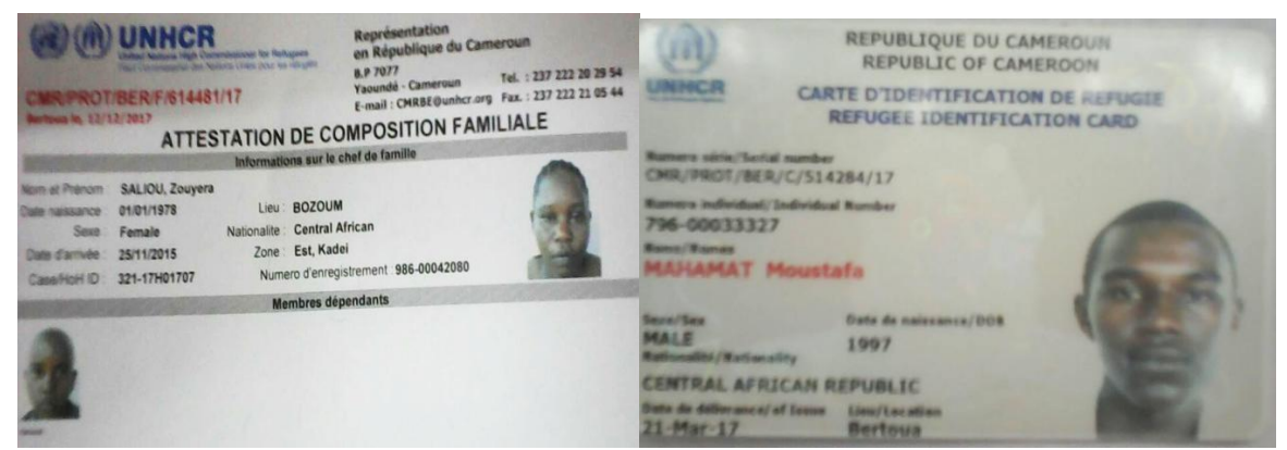
Figure 3: Samples of the Different Identification Papers provided to Refugees

The registration or status determination of the refugees was done through a special biometric system as a pilot project in the Division by the UNHCR in synergy with the Republic of Cameroon. By the year 2017, over 125,000 refugees were registered and were assisted by the UNHCR in the Kadey Division, its implementing partners with strict collaboration with the institutions of the Republic of Cameroon. The refugee identification cards offered by the UNHCR to the CARs in the Kadey Division were of two types which were based on individual identification and on the composition of the family respectively.