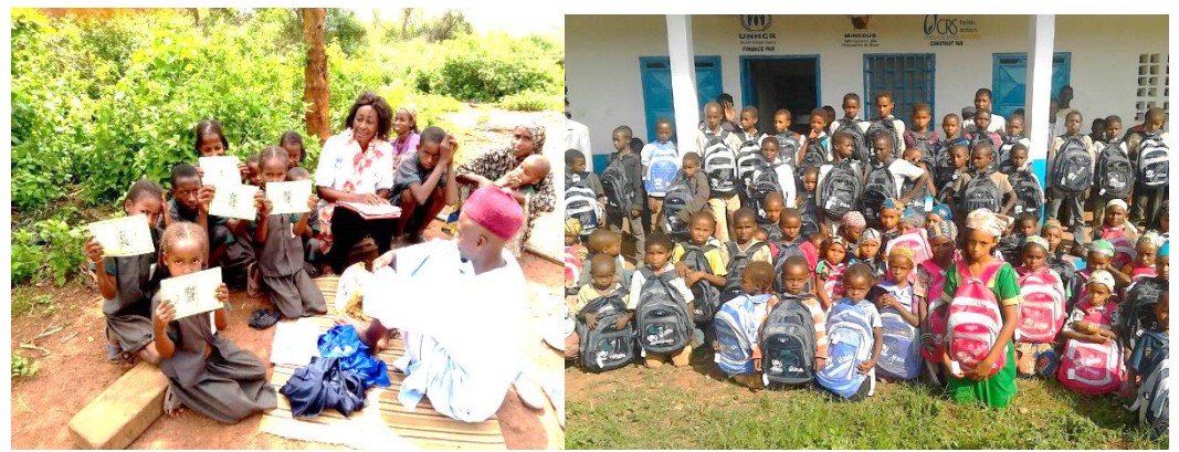
Figure 2: School Kits to Displaced Pupils at Gbiti (Kadey Division)

The Fig 2 above shows samples of school kits handed to the CARs at Gbiti. The financial packages as means of humanitarian assistance that were offered between 2013 and 2016 by the different stakeholders to the refugees and to the respective institutions in the Kadey Division of the East Region of Cameroon depended on the assistance packages that were put at their disposal by the UNHCR/UNESCO. From 2011 to 2016, the secondary school establishments that were at the disposal of the different UNHCR/UNESCO implementing partners were Lycée deKentzou, Lycée de Kuete, Lycée deMbang, Lycée deBoubara, LycéeBilingue deBatouri, LycéeBilingue deMbang, LycéeBilingue deKuete and LycéeBilingue deGariGombo.