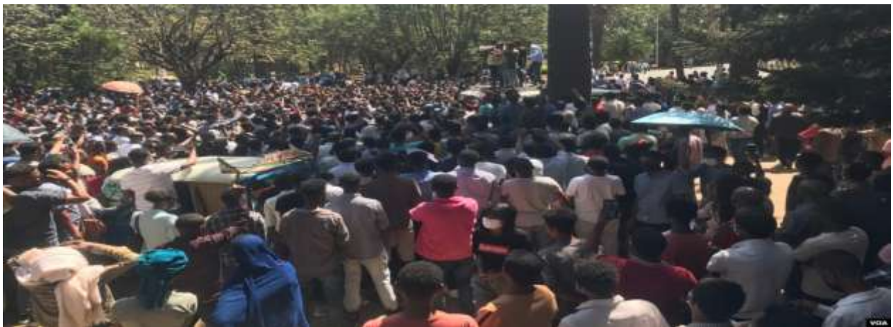
Fig 1. One of the Protests against government in Ethiopia

Courtesy: Voice of America (VOA) Amharic service-April 21, 2021.