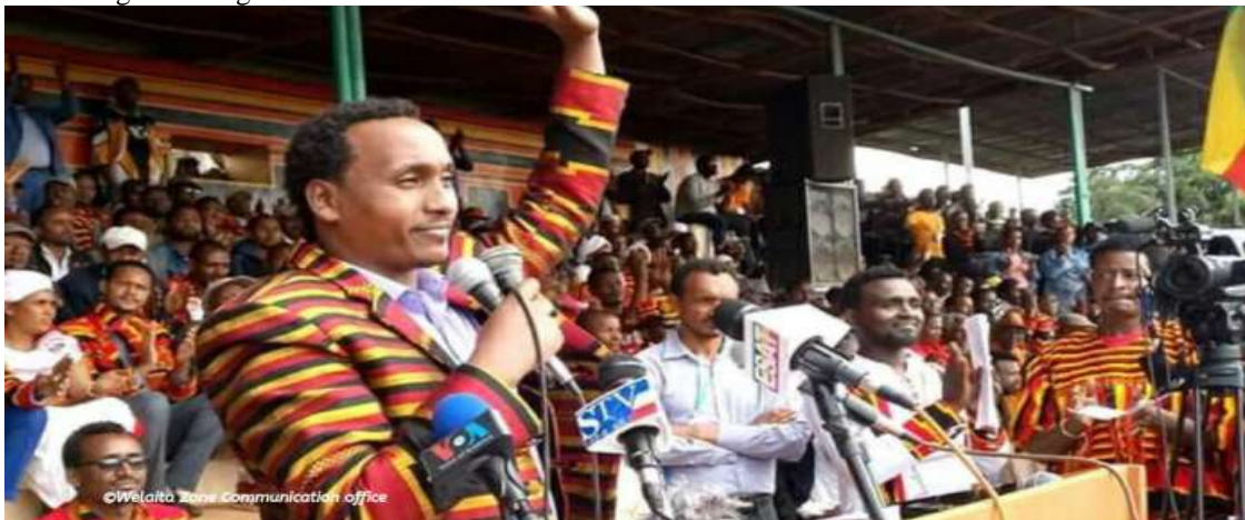
Pic2:Wolayta leaders arbitrarily arrested; and jailedfor 10 months until the election 2021.